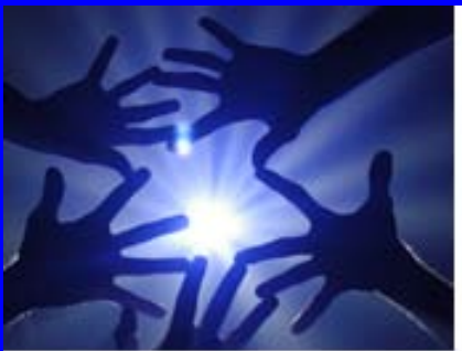
First Light Theatre Project

School budget proposals will be reviewed at the following meetings: