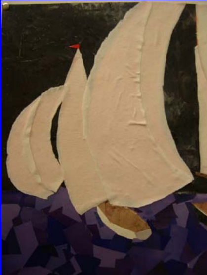
Artwork by Jack Barron, Grade 7

Trolling: Intentionally posting provocative messages about sensitive subjects to create conflict, upset people, and baiting them into "flaming" or fighting.