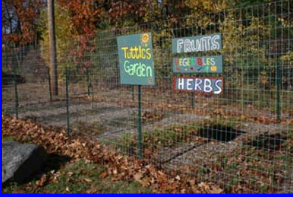
Tuttle's Garden with the newly installed fence.